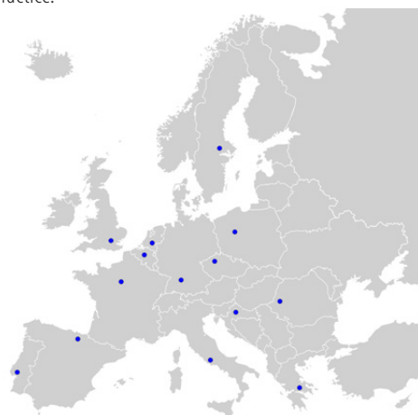
The location of the seminars around Europe

The seminars around Europe will offer the opportunity to present not only the results of the SBRIplus project, but also the advanced application to innovative solutions in addition to national regulations and practice.